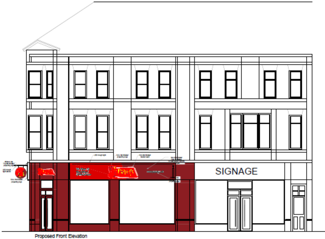
Proposed Fascia sign from advertisement consent Ref: 2021/1142