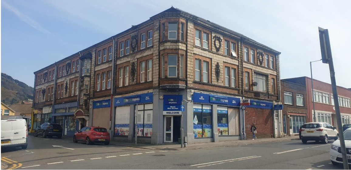
Talbot Road elevation: